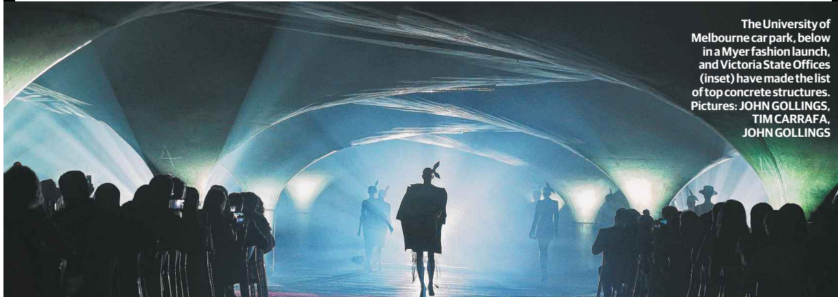
The University of Melbourne car park, below in a Myer fashion launch, and Victoria State Offices (inset) have made the list of top concrete structures.